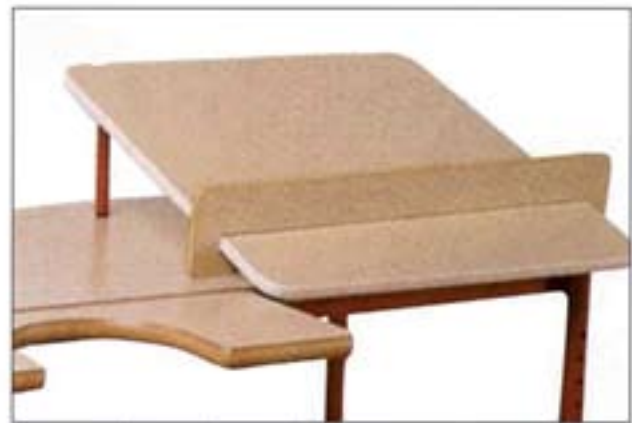
Sp-11 - Table Attachment, Inclined Top