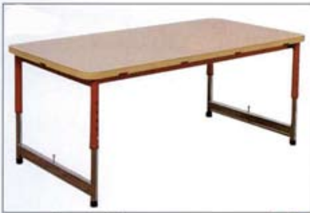
Sp-00 - Table, Adjustable, Low Range