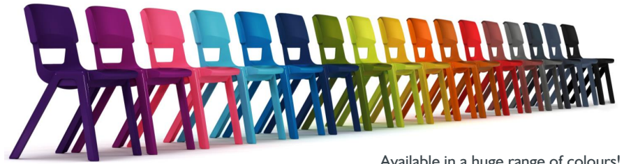
Available in a huge range of colours!

Clever research, genuine science and seriously comfortable. Our high performing chairs give you more confidence with a 20 year warranty.