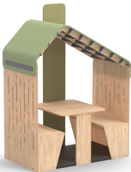
1 x Learning Hut