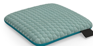
1 x Laylow Pad