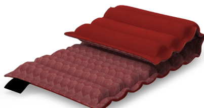
1 x Laylow Raft