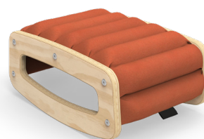
1 x Rocking Perch