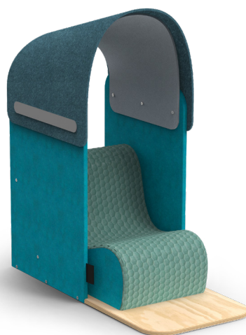
1 x Hideaway Hood 1 x Hideaway Seat