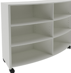
Curved Bookcase 900mm