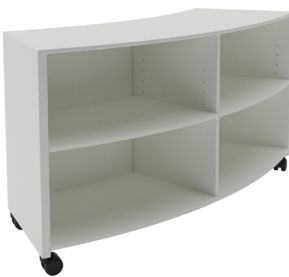
Smart Curved Smart Bookcase 720mm