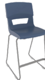
Postura Plus Sled Base Stool

The updated spaces now function to encourage feedback and future planning. Staff and students are actively engaging with the environments, helping to shape the rollout of flexible, effective learning spaces across the school.