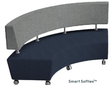
Smart Softies™ Curve Lounge