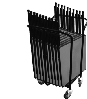
Folding Exam Square Desk Trolley