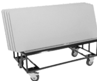
DuraLite Table Trolley