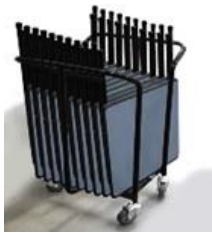
Square Trolley = 12x tables