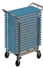
Rectangle Trolley = 15x tables