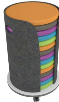
Create-A-Pods with Holder (Option B: Purchase as a complete set, with 15 Create-A-Pods)