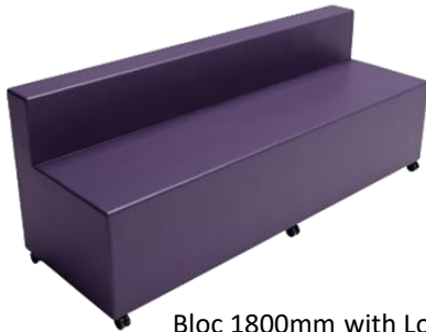
Bloc 1800mm with Low Back