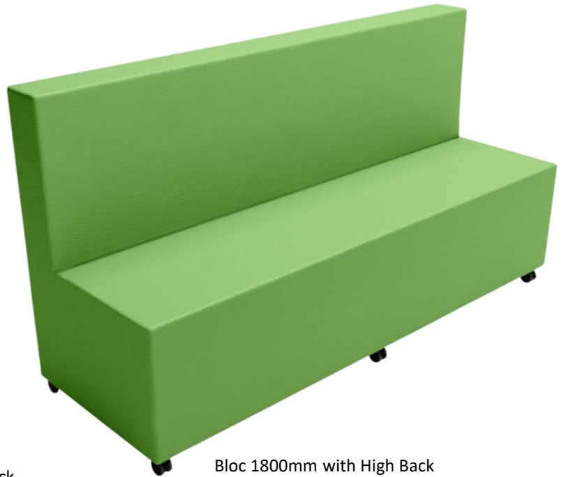
Bloc 1800mm with High Back