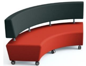
Smart Softies Curve Ottoman with High Backrest