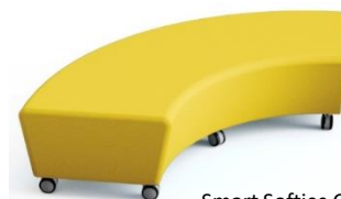
Smart Softies Curve Ottoman