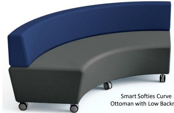
Smart Softies Curve Ottoman with Low Backrest