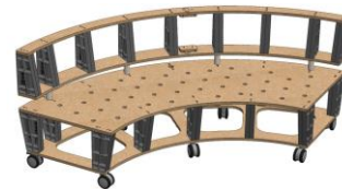
Smart Softies Carcass Construction