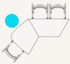
StingRay with Trap Table